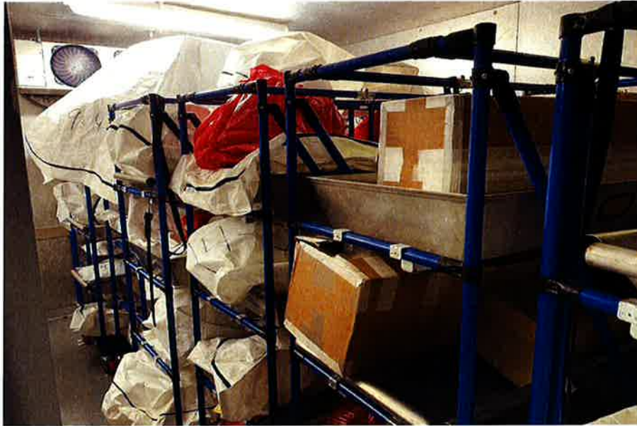
Figure 1 The Office of the Chief Medical Examiner's Freezer for Long-Term Storage of Decedents

The OCME is responsible for conducting medicolegal death investigations for certain deaths reported to chief medical examiner or his or her designee, a county medical examiner, or a county coroner, pursuant to §61-12-8 of W.Va. State Code . A medicolegal death investigation is initiated in order to investigate and certify the cause and manner of an unnatural or unexplained death. The OCME does not investigate all deaths that occur in the state; however, the cases it investigates include when any person in this state dies: