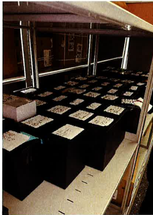
Figure 2 Cremated Remains of Unclaimed Decedents at the Office of the Chief Medical Examiner