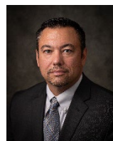
Jeffries 61 Chair