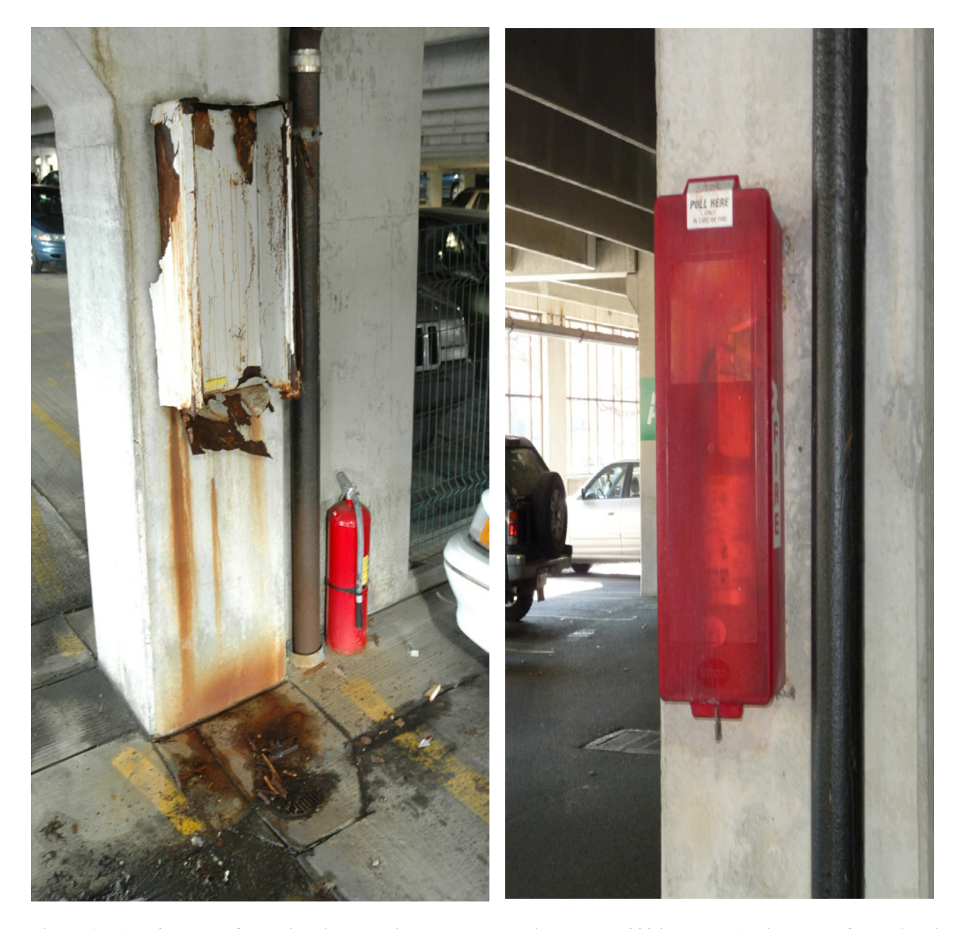
Figure 1 – At left, rusted fire extinguisher cabinet as presented in the May 2006 report. At right, new fire extinguisher enclosure to replace deteriorated metal cabinet.