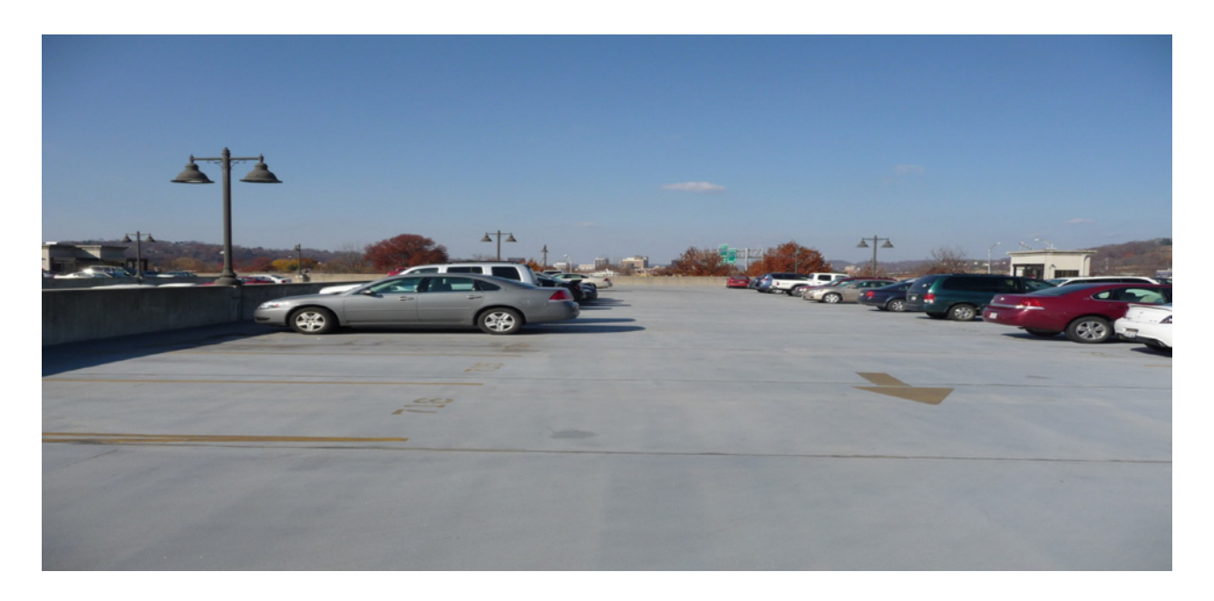
Figure 4 - A new roof deck coating has been applied to prevent water penetration.