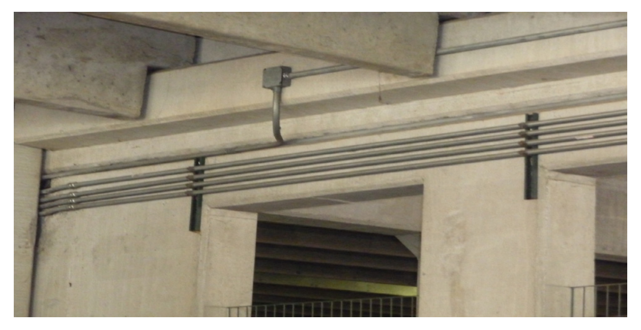
Figure 7 - Replaced electrical conduit and supports.