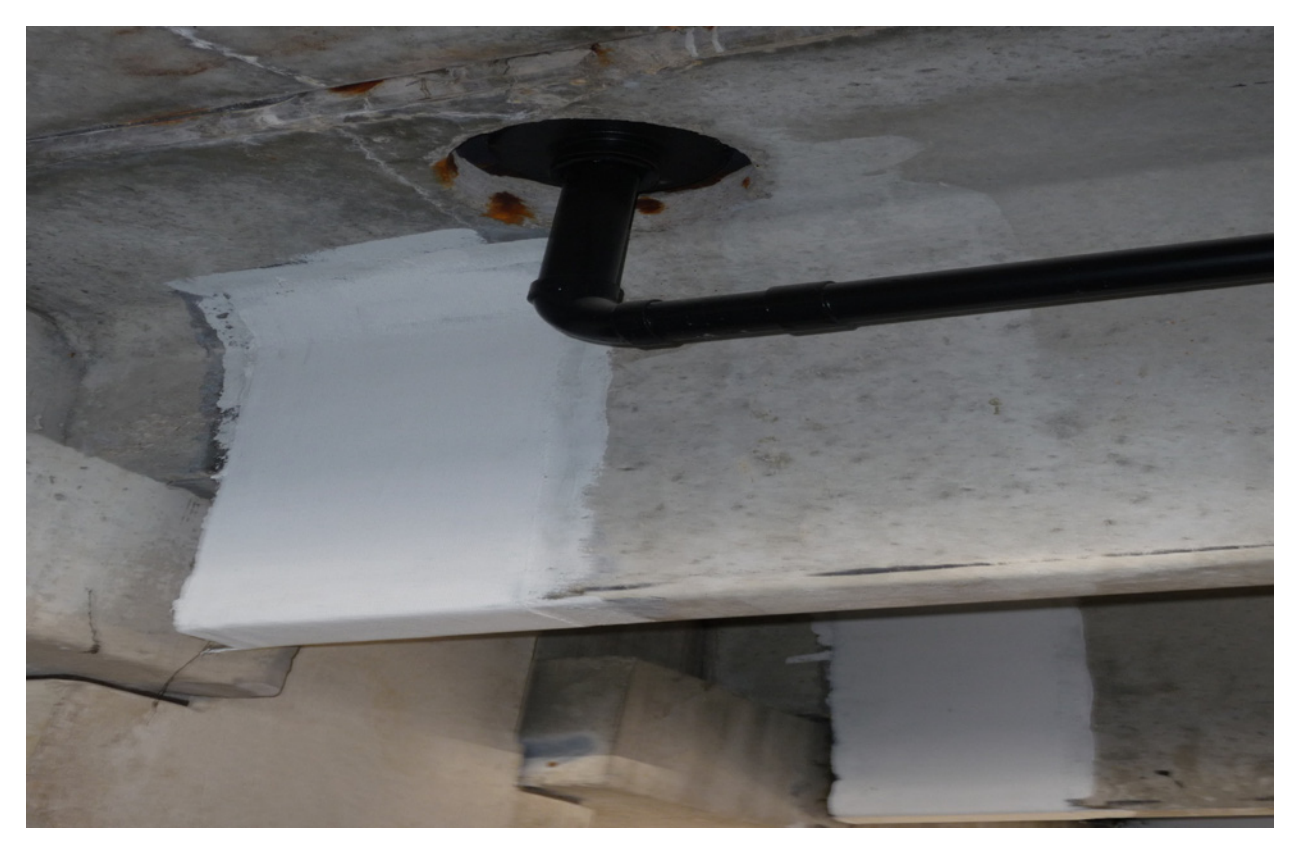
Figure 5 - A new roof drain has been installed to prevent water ponding.