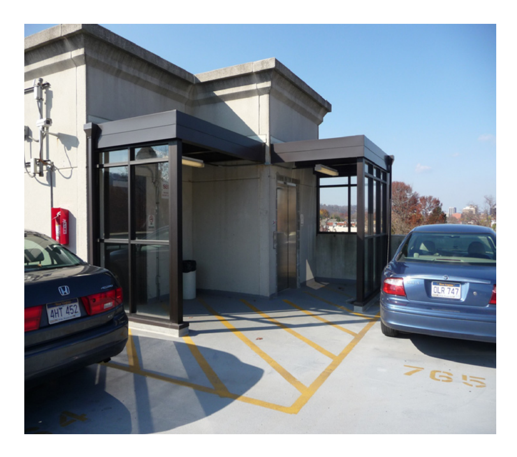
Figure 9 - New roof deck elevator enclosure to reduce water damage to elevators.