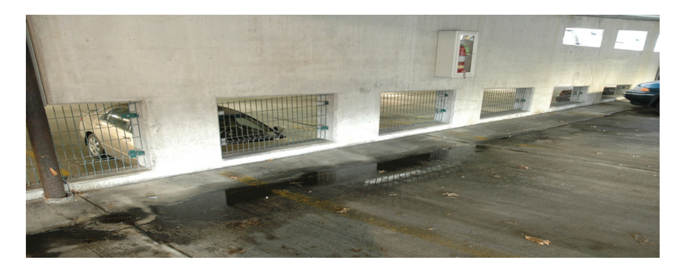
Figure 3 - Water pooling on garage floors as shown in the May 2006 report.