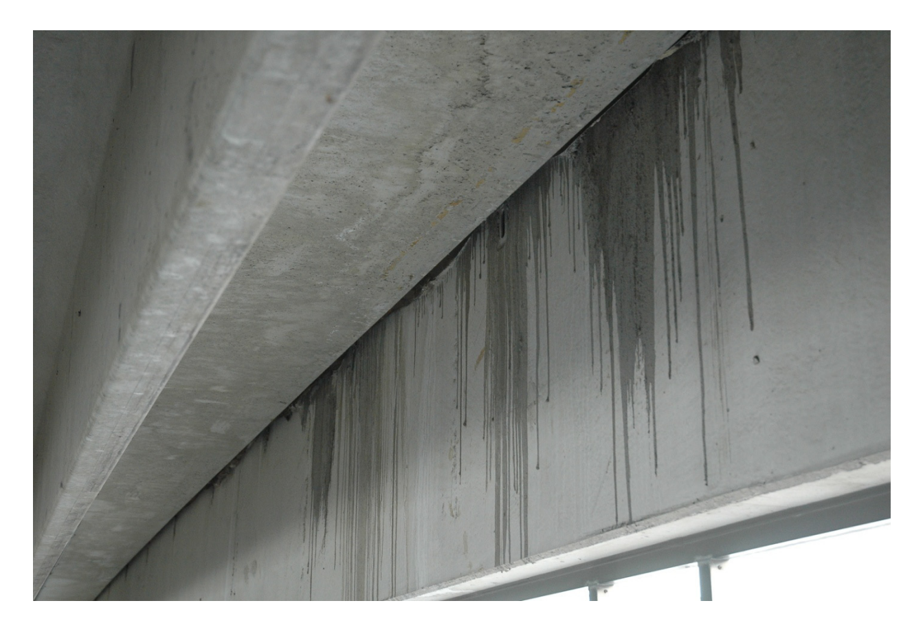
Figure 2 - Water leakage from the roof of the garage as photographed for the May 2006 report.