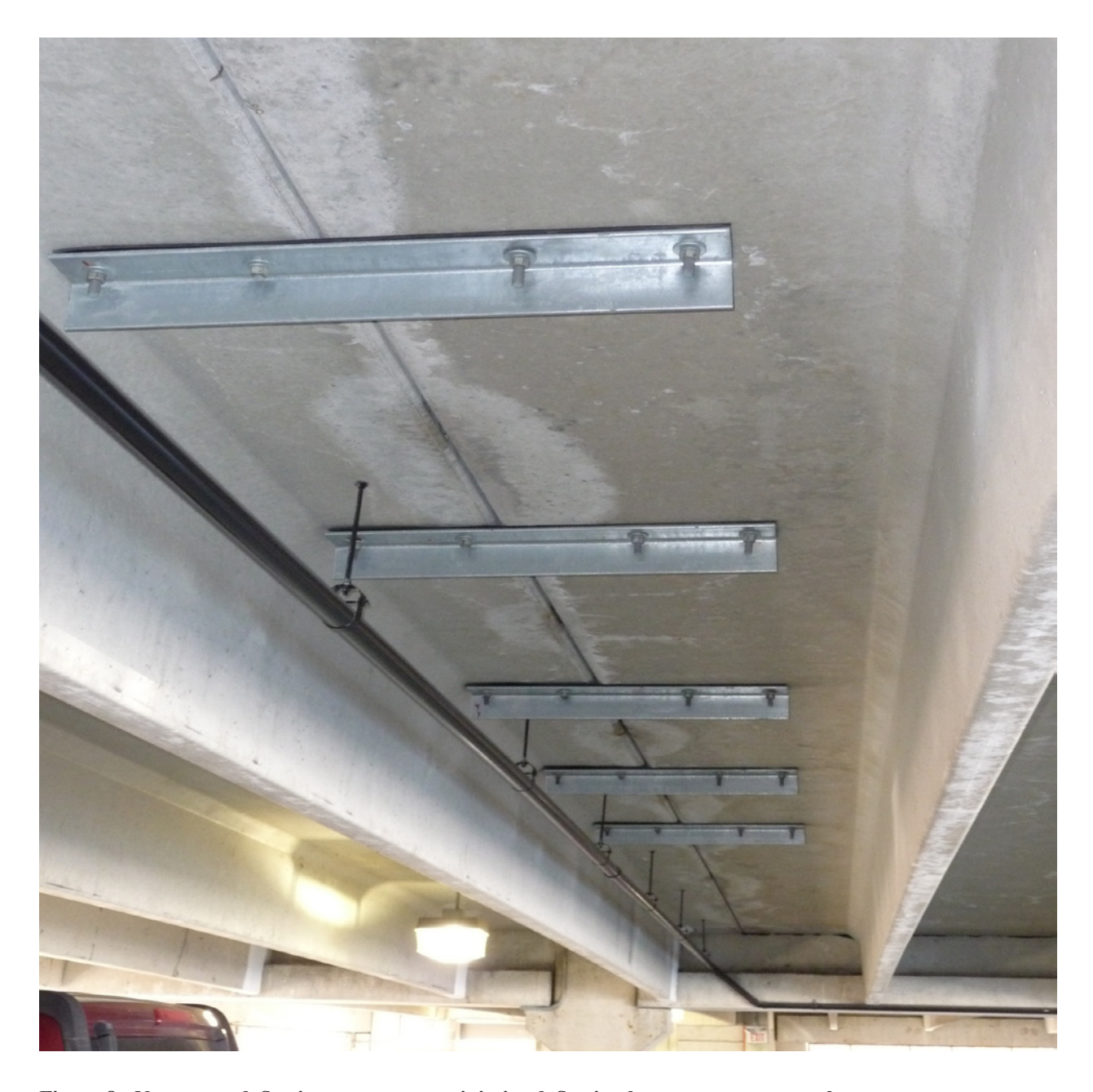
Figure 8 - New ramp deflection supports to minimize deflection between precast panels.