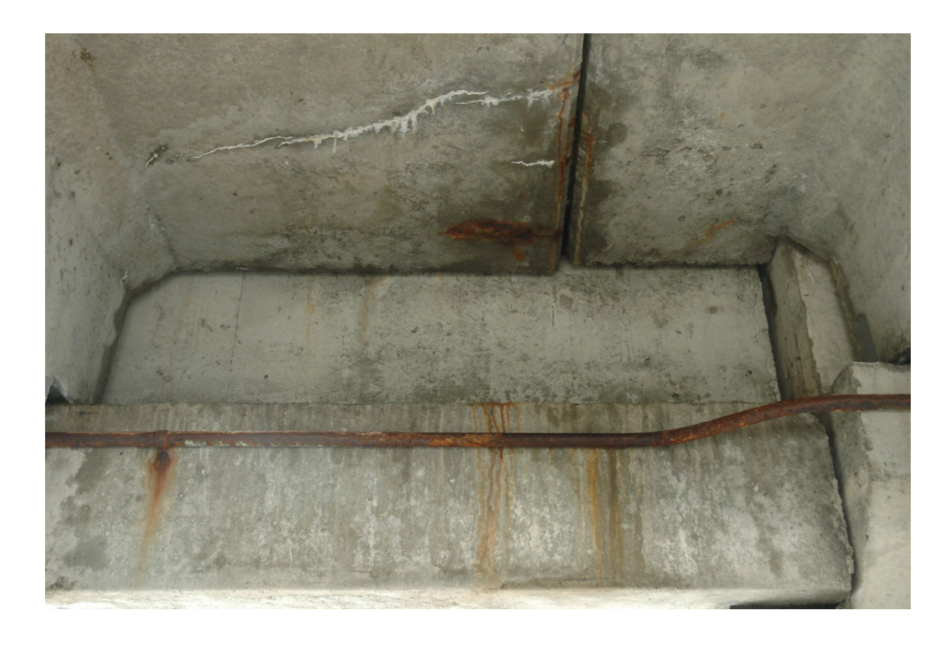
Figure 6 – Rusty electrical conduit as photographed for the May 2006 report.