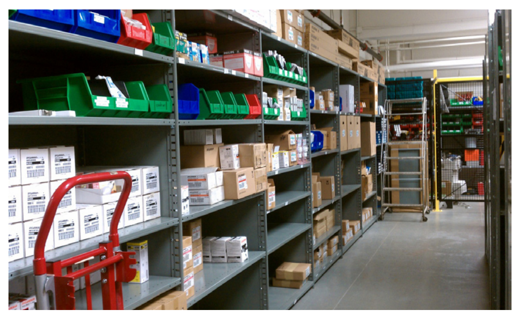
Figure 1 - Supplies in Inventory, Room MB12-B