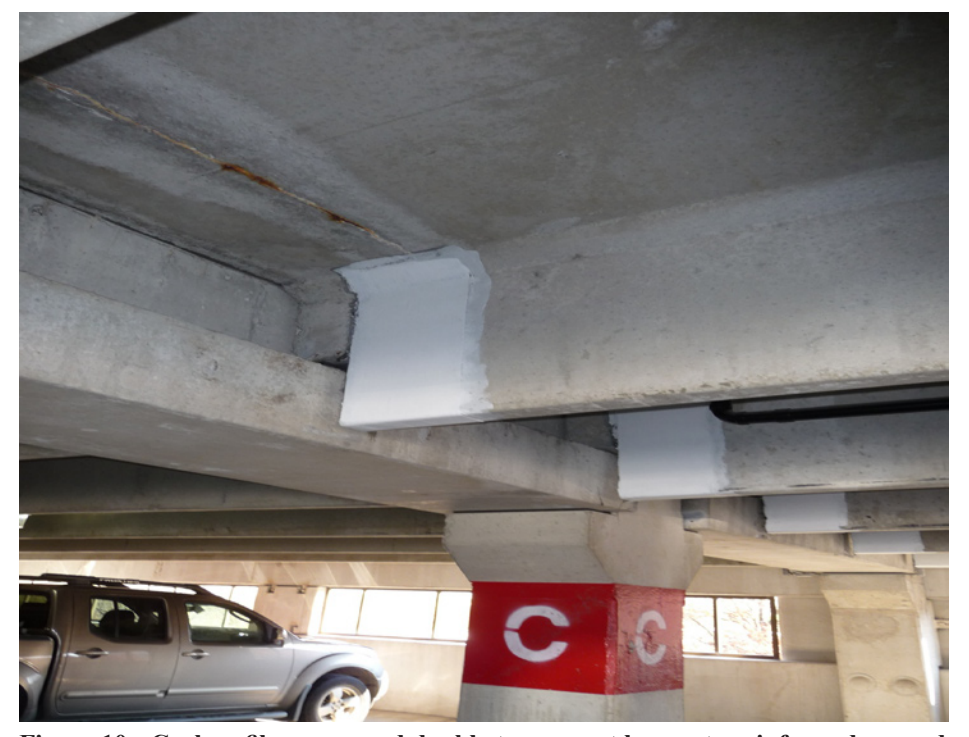
Figure 10 - Carbon fiber wrapped double tee precast beams to reinforce damaged precast concrete.