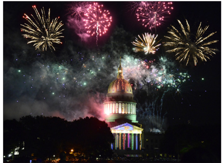
MARTIN VALENT WEST VIRGINIA LEGISLATURE