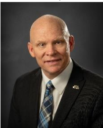
Longanacre - Greenbrier, 42