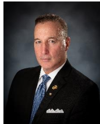
Honaker - Greenbrier, 42