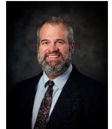
Hott - Grant,