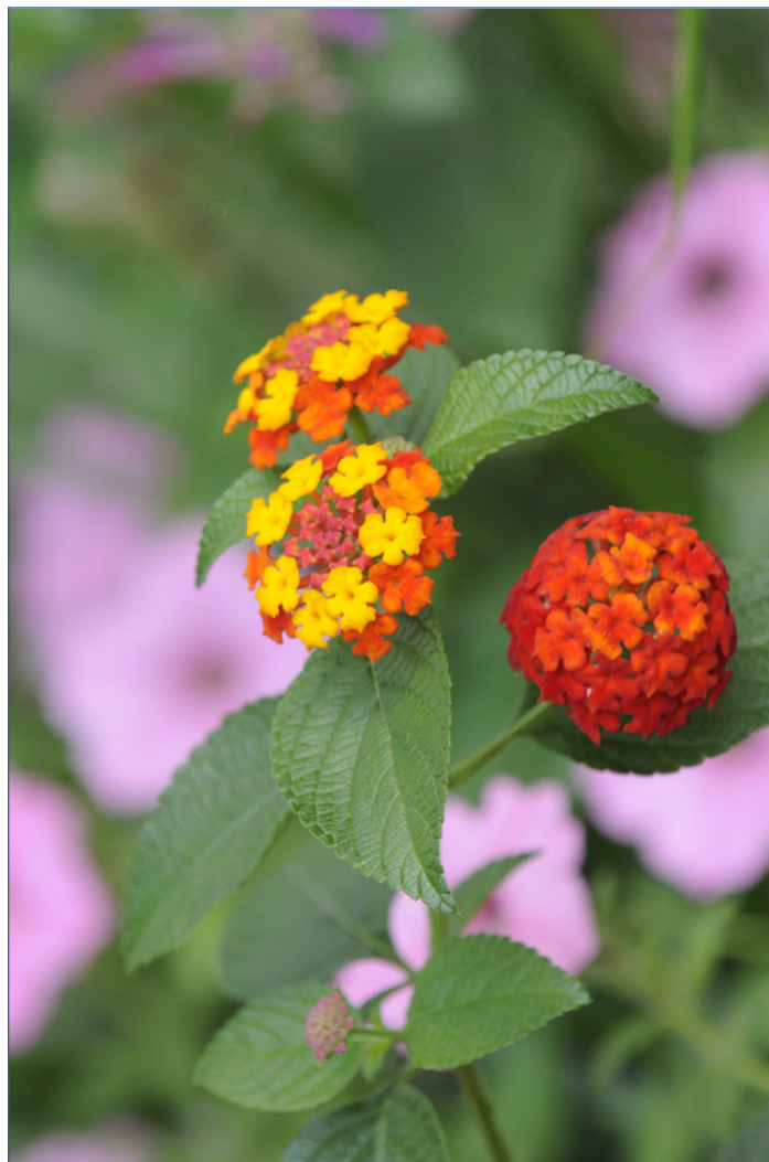
Capitol flowers continue to bloom through the summer months.