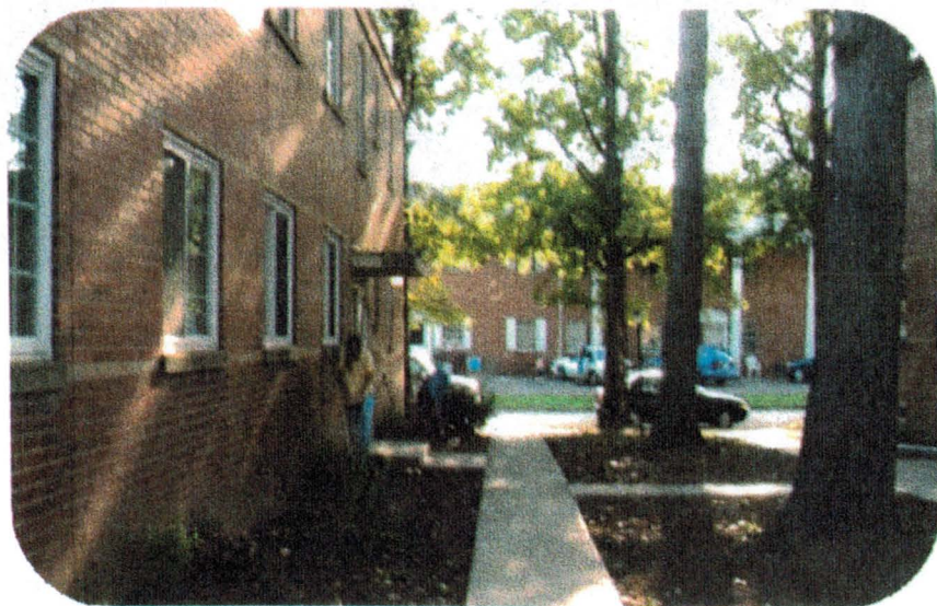
963 Washington Avenue in Huntington.

The Housing Development Corporation, a private, nonprofit housing agency in Huntington, West Virginia, recently announced the completion of its 32-unit housing property.