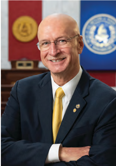
CRAIG P. BLAIR President of the Senate Lieutenant Governor

CRAIG P. BLAIR, Republican, Berkeley County, 15th District. Elected to the House 2002-2008; Elected to the Senate 2012-2020. Elected President of the Senate 85 th and 86 th Legislatures. See other biographical information on page 479.