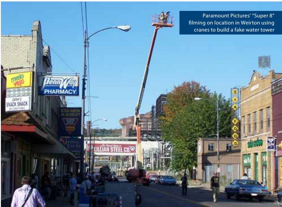
Paramount Pictures' "Super 8" filming on location in Weirton using cranes to build a fake water tower

For example, the influx of direct expenditures relating to six (6) recent miniseries that filmed in the Eastern Panhandle from 2012-2015 effectively “saved” a hotel that was operating “in the red.” The combined room nights for multiple hotels in Jefferson and Berkeley counties totaled more than $10,000. According to its general manager, the hotel that was struggling began operating “in the black” due to these productions alone.