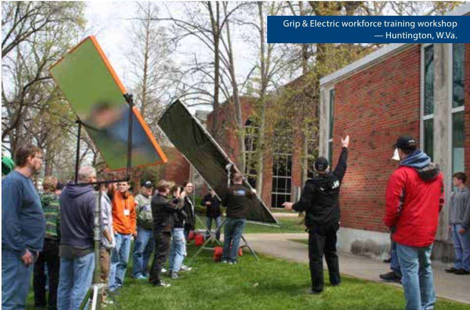
Grip & Electric workforce training workshop — Huntington, W.Va.

In early 2013, the Film Office confronted the dilemma of the state's limited workforce with film industry specific skill sets. It repurposed portions of its marketing budget and directed those limited funds toward workforce training programs.