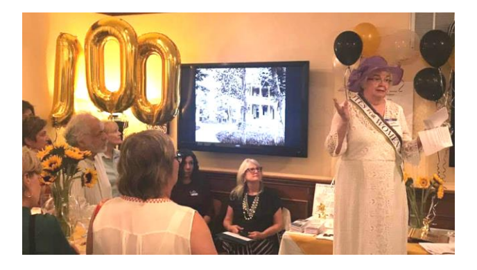
The Commission thanks our staff, volunteers, partners, sponsors, donors, and all those who help us continue our efforts to improve the lives of West Virginia women and their families.