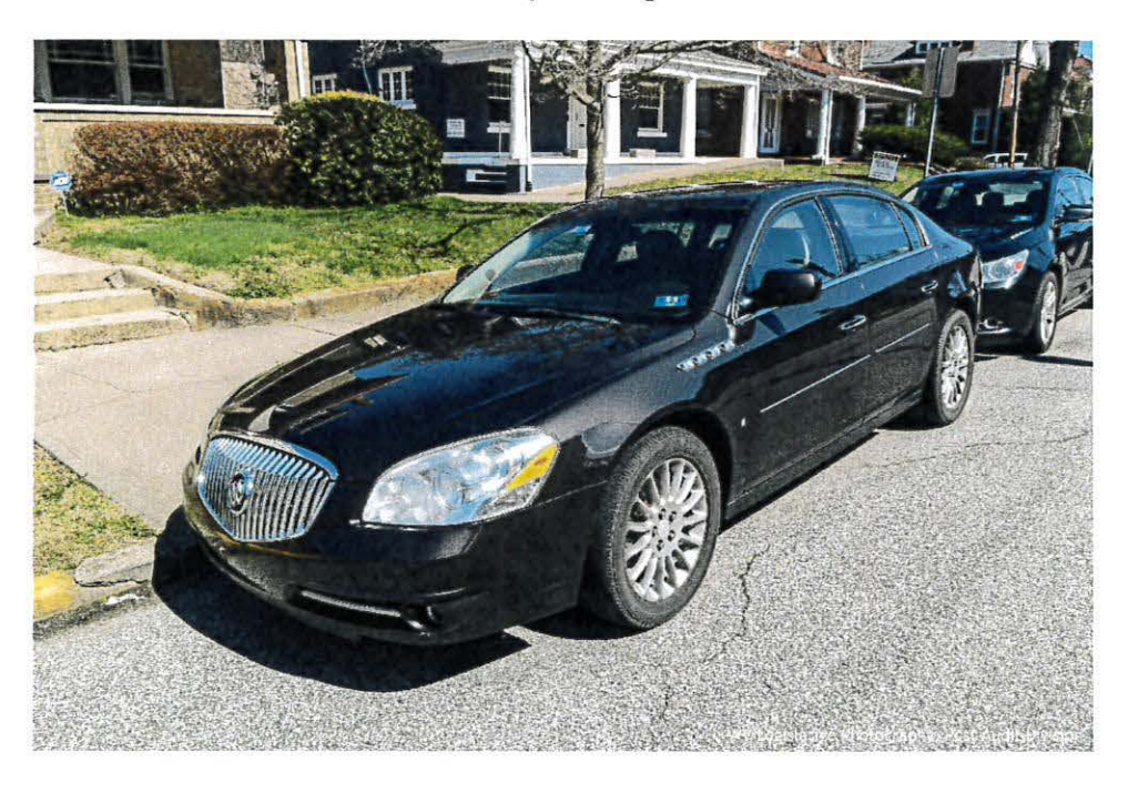
Figure 1 Picture of Buicks Used by the Supreme Court Justices