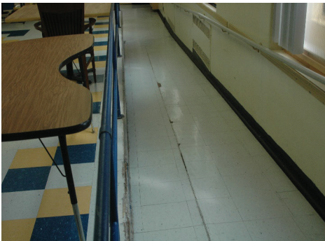
Figure 1 Damaged floors

DHHR indicated to PERD that Jackie Withrow Hospital's use of contracted healthcare staff has stretched its operating expenditures over its budget and has impacted its ability to conduct renovations and modern reconstructions while allowing it to only respond to ". . . urgent and critical repairs necessary to protect the safety and wellbeing of employees, patients and visitors."