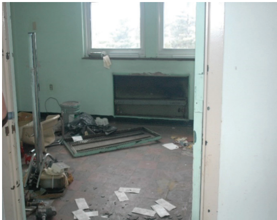
Figure 4 Room unusable floor

Currently, 50-percent of the Jackie Withrow facility is not being used to serve patients or accommodate DHHR staff and of this amount, only 20-percent is currently capable of treating patients. The other 30-percent is unusable and has been for over twenty-years.