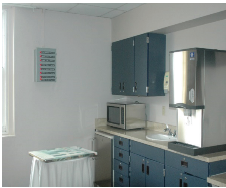
Figure 6 Pantry Tuberculosis Unit