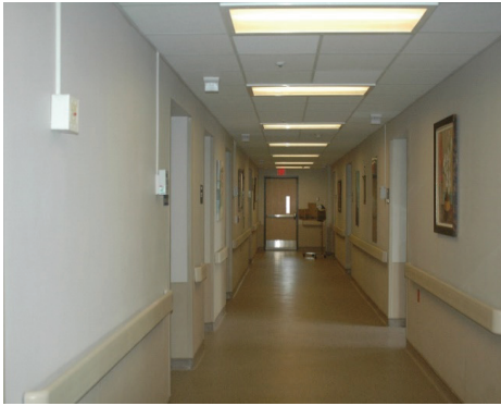
Figure 5 Hallway Tuberculosis Unit