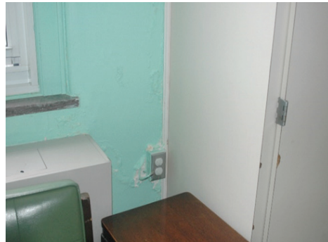
Figure 2 Water damage to walls