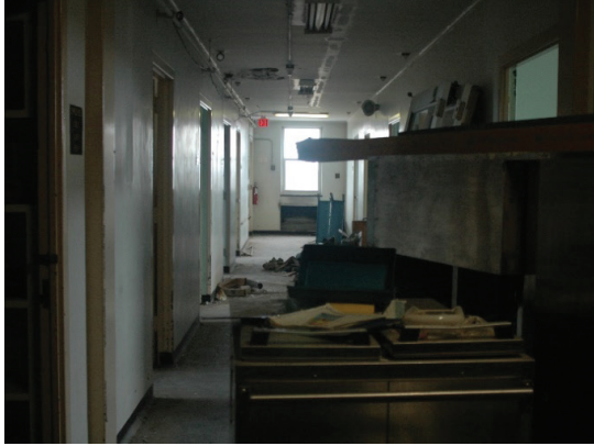
Figure 3 Hallway unusable floor

30-percent is unusable and has been for over twenty-years. These areas would need considerable repairs in order to be usable again. Nevertheless, these areas are heated and cooled regardless of use. Figures 3 and 4 are pictures of areas of Jackie Withrow Hospital that are unusable.